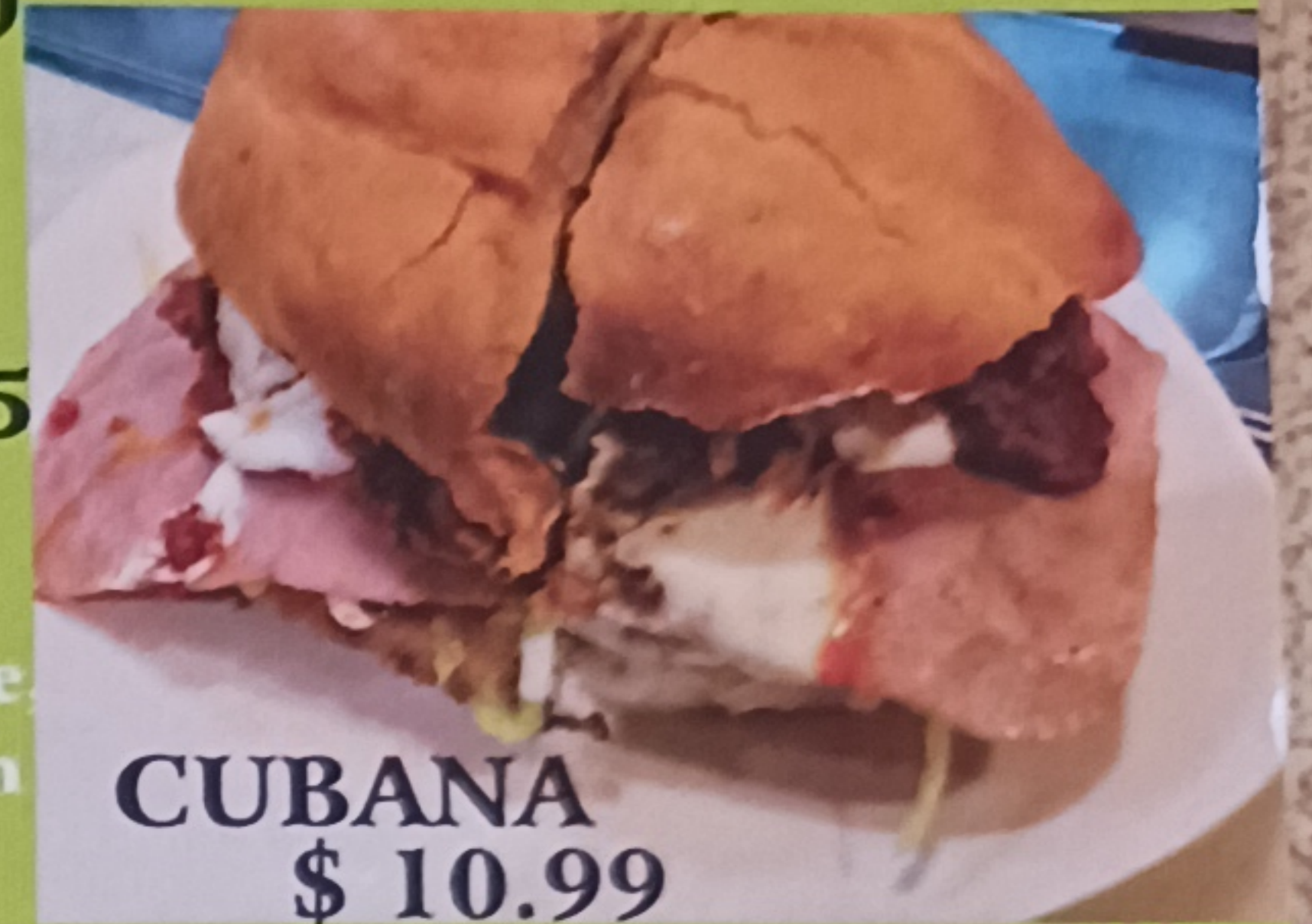
CUBANA $ 10.99